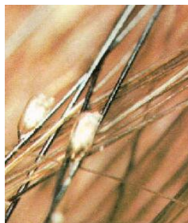
Close up of nits in hair.