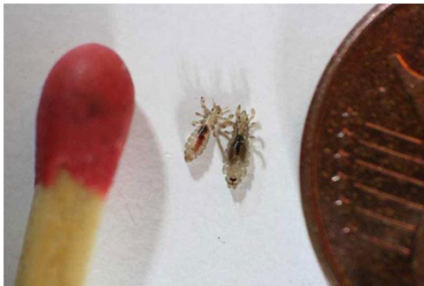
Actual size of lice next to a match head.