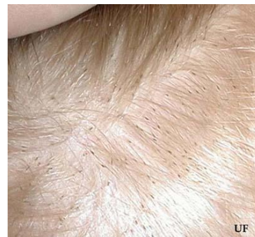
Nits in hair. Very difficult to see.